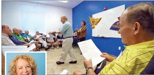
Submitted Photos The dementia respite program at St. Mark's provides structured activities for participants.

Now there is good news for Marco Island caregivers and their loved ones. A new dementia respite program has just begun at St. Mark's Episcopal Church on the corner of Collier Boulevard and East Elkcam Circle. Ten participants are enrolled, with room for four more, who will meet each Wednesday for four hours from 10:30 AM to 2:30 PM. Under the direction of staff selected by the Naples Senior Center with the help of th-